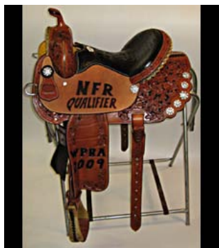
Qualifier - Donated by C Bar T Productions

The WPROA deeply appreciates our donors in the Saddle Rotation program. This program provides a saddle to each WNFR Qualifier, as well as provides a saddle recognizing the Fastest Time, Rookie of the Year and the Reserve World Champion. Watch below and click for more information.